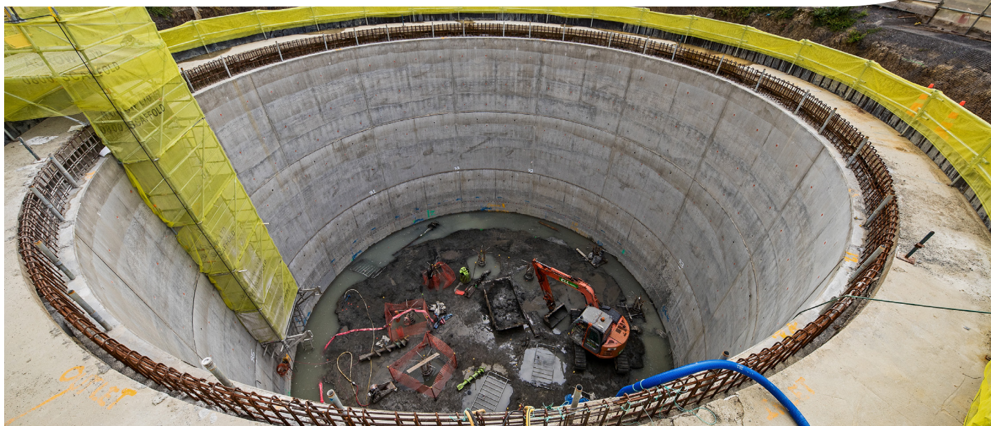
Concrete storage tank 12 metres into the ground.

Watercare and our contractor, McConnell Dowell, have been upgrading the wastewater network in your area since August last year.